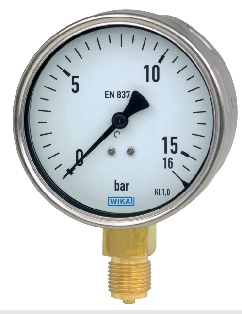
Bourdon tube pressure gauge model 212.20